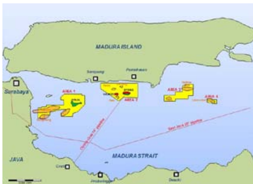
Oyong and Wortel Field Location Map

Production from Wortel commenced on 31st January. Wortel-3 and Wortel-4 are both flowing at a combined rate of 47MMscfd (million standard cubic feet per day). The combined rate of Oyong and Wortel gas is 85MMscfd (90BBTU/d) (billion British thermal units per day) which is equal to the contract quantity to be sold to Indonesia Power.