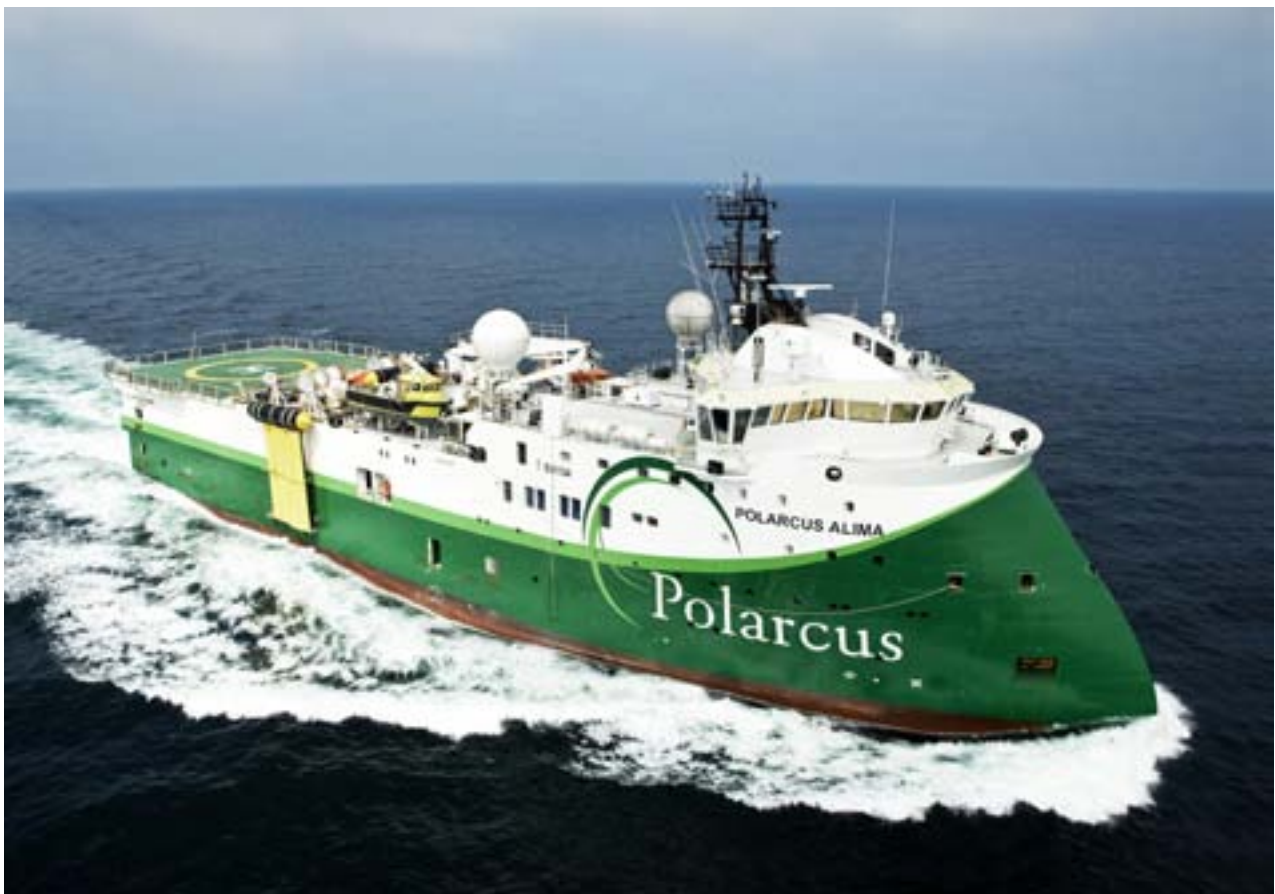
Seismic vessel Polarcus in operation at Maari, Taranaki Basin, New Zealand

(ASX: CUE, NZX: CUE, POMSOX: CUE, ADR/OTCQX: CUEYY)