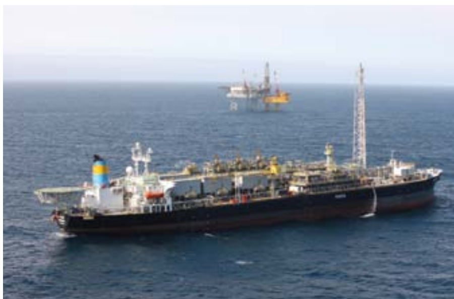
Maari Wellhead Platform and Raroa FPSO

3D seismic acquisition over the Maari field and Pike prospect commenced on 31st March and is now completed.