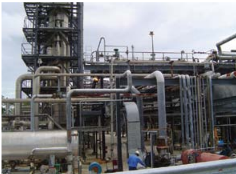
SE Gobe Facilities

The construction of facilities to process the associated gas and gas cap from SE Gobe continues. The gas will be exported to the PNG LNG gas pipeline and LNG processing plant from June 2014.