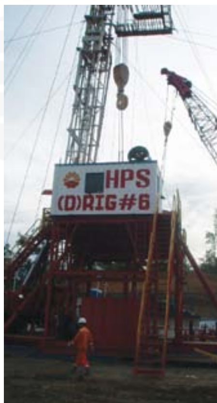
Well Site at Naga Utara-1