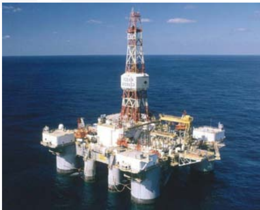
Ocean America Semi Submersible Drill Rig

The current license term is due to expire on the 31 July 2012 and an application to renew the permit has been submitted to the government by the Joint Venture. Interpretation of the Zeebries 3D seismic survey is ongoing with the objective of defining new drillable prospects.