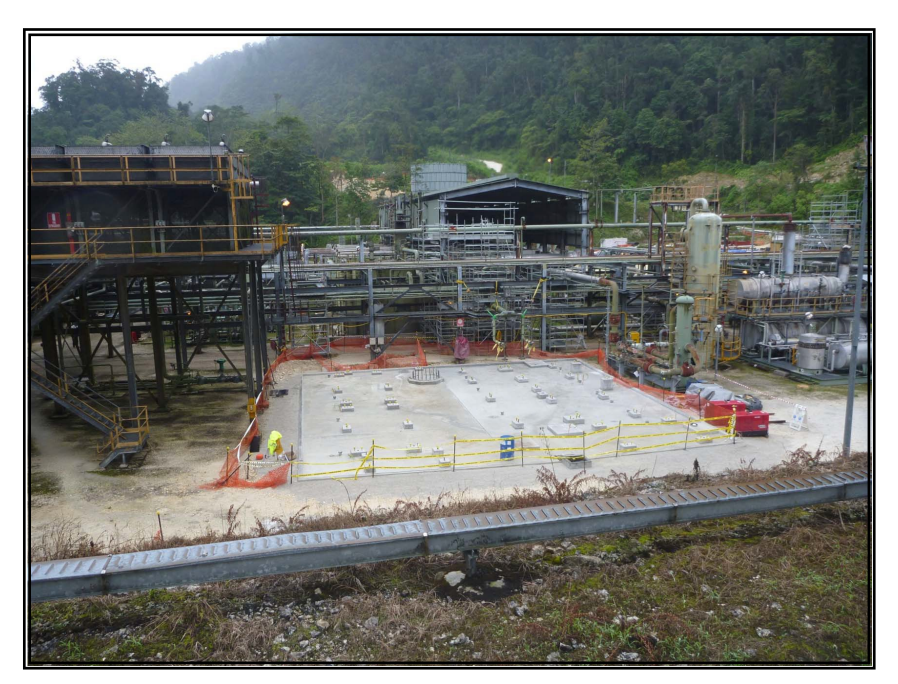
Construction of the Associated Gas Processing Plant in Progress at SE Gobe, PNG

The construction of facilities to process the associated and gas cap gas from SE Gobe is underway. The gas which will be used for commissioning the PNG LNG gas pipeline and LNG processing plant is expected to be produced from June 2012