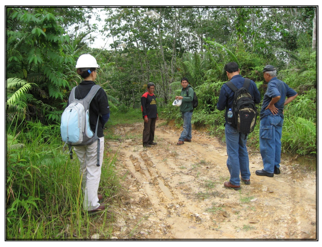
SPC Staff Surveying Naga Selatan Well Location Kalimantan, Indonesia

Cue has received approval from MIGAS for the farmin to the Mahakam Hilir Permit. The farmin transaction has been completed and the farmin consideration paid to SPC. Preparations are underway to drill the first two exploration wells called Naga Utara (Northern Dragon) and Naga Selatan (Southern Dragon). Drilling is expected to commence in December. The most likely recoverable reserves have been estimated to be 80BCF of gas and 20 million barrels of oil from the two prospects, respectively.