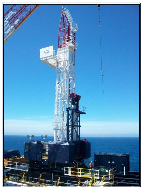
Workover Rig in Operation—Maari Platform

Production was below forecast due to continued electrical submersible pump (ESP) problems. The ESP in the MR1 well was replaced during the quarter and problems were experienced in restarting the pump after the workover. The fault was eventually traced to a failure in the power console of the variable speed drive unit at surface. A workover was successfully completed to replace the ESP in MR4. The well was brought back into production in mid July. A further failure of the MR5 ESP during the quarter was traced to a failure of a cable splice 12 metres below tubing hanger. A workover was successfully completed to resplice the cable. The MN1 well tripped on high current. Several attempts to restart the pump failed. It has been concluded that the ESP has failed downhole. A workover is in progress to replace the defective ESP. The operator is working with the pump supplier, Schlumberger to maximise the pump run life. Weatherford's Clearwell scale control technology has been installed and is being trialled to determine whether it will inhibit scale formation within the ESPs.