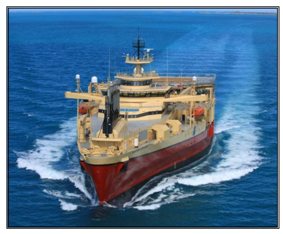
Movida 3D Seismic Survey Acquisition

The secondary 3 year term of the licence has been entered into. The forward work programme commitment consists of geotechnical studies and the acquisition and interpretation of 150 sq km 3D seismic. The acquisition of the Zeus-MC 3D seismic survey which will cover part of WA-361-P has commenced. The 3D seismic data is expected to be available for interpretation in 1Q 2012.