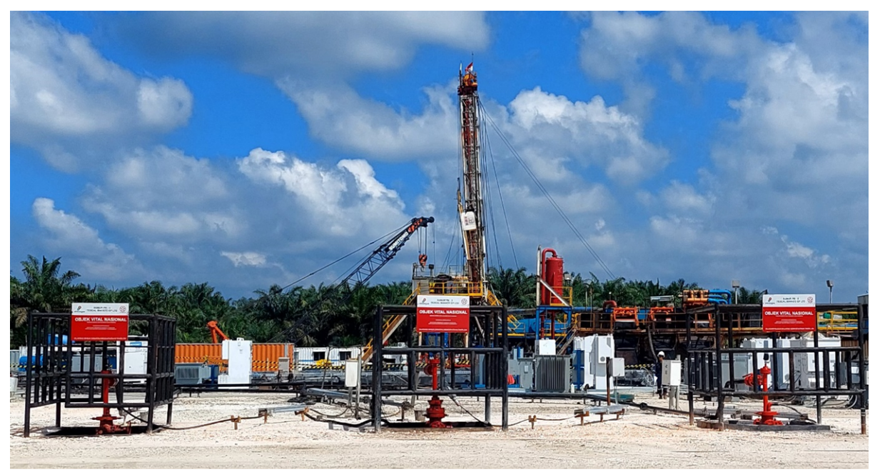
Wellheads and drilling rig at PB field, Mahato PSC

The first development well in the current phase of drilling, PB-18* has commenced. Wells are expected to take approximately 1 month to drill and complete, so the current program is expected to take 12-14 months. The initial wells will be drilled from the existing well pad with later wells drilled from a new location in the northern area of the field, where additional oil processing capacity will also be constructed.